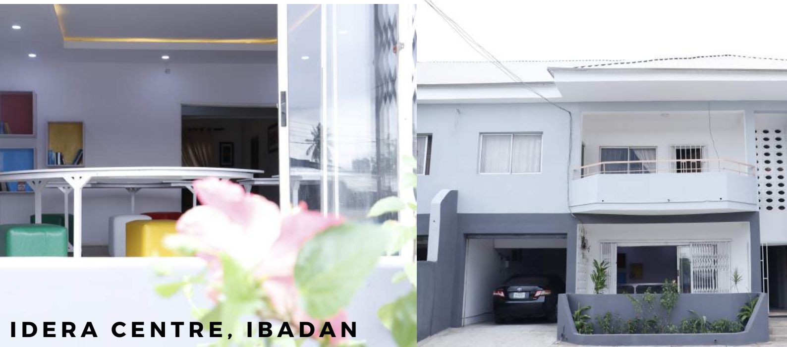
IDERA CENTRE, IBADAN

With your help, we achieved the target of increasing our residential care capacities by at least 100% in the first half of 2021. This means we have more loving homes for homeless children and young people who need a safe place to reconstruct a positive life. We opened a new home in Ibadan, Oyo state on the 27th of May, 2021. We call the home Idera, expressing our hope that every child who comes into the home will find respite, love and stability, away from the negativities of the street life.